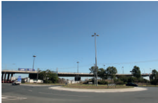
Closures 1 & 2 Northern Todd Road roundabout