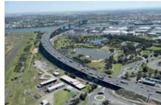
Closure 4 Both intersections