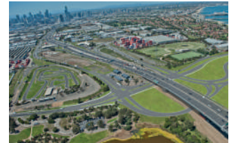
Completed Todd Road Intersections