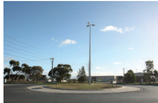
Closure 3 Southern Todd Road roundabout