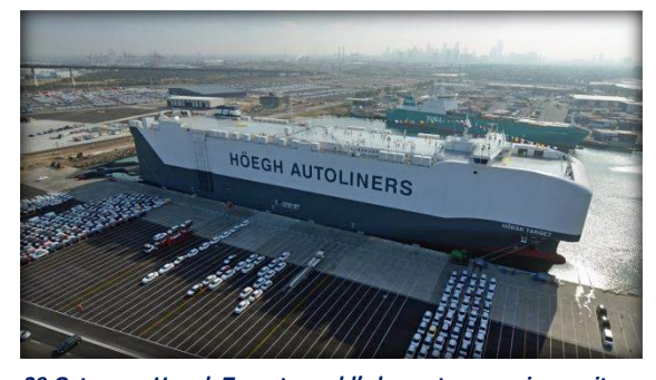
29 Oct - new Hoegh Target, world's largest car carrier, on its maiden voyage to Melbourne, at the new Webb Dock berths

Internal transport movements at night within the port area only are continuing, along with a number of day time transfers during off peak (nil impact on traffic). Compliance with EPA noise guidelines is mandatory for out of hours works. All contractors are required to monitor noise levels. 24/7 queries: 1800 451 056